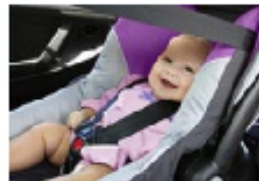
Up to 6 months Approved rear-facing child car seat