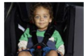
6 months to 4 years Approved rear- or forward-facing child car seat