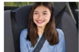
145cm or taller Suggested minimum height to use adult lap-sash seatbelt