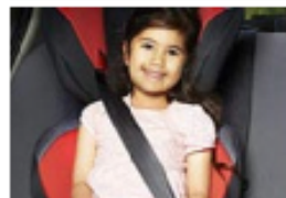
4+ years Approved forward-facing child car seat or booster seat